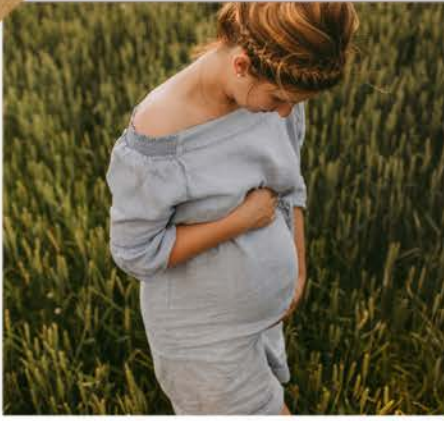
A HOME FOR NEW LIFE Monroe Michigan

When moving forward, it's always good to reflect back on how far we've come. Below is our story.